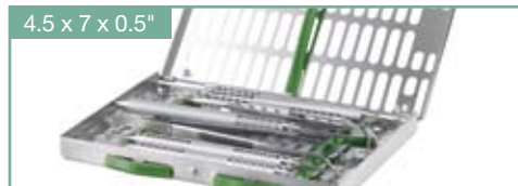
SysTM 3 4.5 x 7 x 0.5" (114 x 178 x 13 mm)