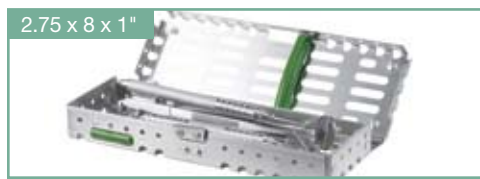
Quarter-size 2.75 x 8 x 1" (69 x 203 x 25 mm)