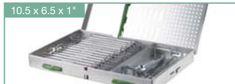
SysTM 4B 10.5 x 6.5 x 1" (267 x 165 x 25 mm)