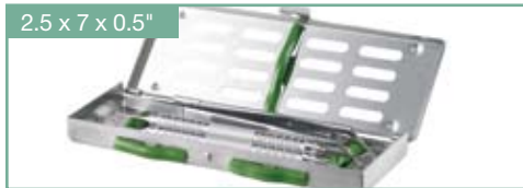
SysTM 1 2.5 x 7 x 0.5" (64 x 178 x 13 mm)

Select from four sizes, designed to fit the Statim 2000 and 5000.