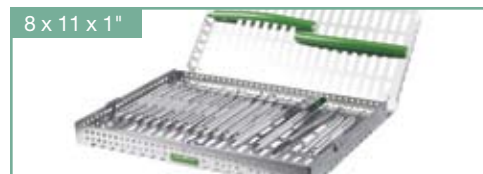
Full-size 8 x 11 x 1" (203 x 280 x 25 mm)

Select from five available sizes, designed to fit the Statim 7000 in a modular fashion, and ensure effective use of space. Double hinged for easy lid management at chairside. Scalloped instrument supports keep instruments in place.