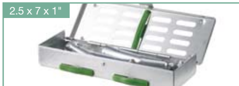
SysTM 2 2.5 x 7 x 1" (64 x 178 x 25 mm)