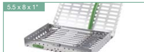
Half-size 5.5 x 8 x 1" (140 x 203 x 25 mm)