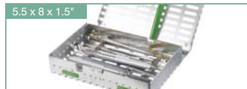
Half-size, Double Stack 5.5 x 8 x 1.5" (140 x 203 x 38 mm)