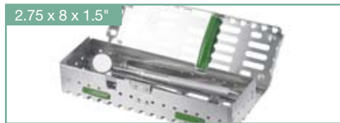
Quarter-size, Double Stack 2.75 x 8 x 1.5" (69 x 203 x 38 mm)