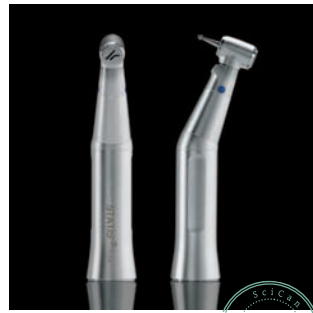
STATIS ® 1.1 L

The choice for crown preparation and all other tasks that require the highest level of controlled power. 1:5 transmission ratio, up to 200 000 revolutions/min-1. FG chuck Ø 1.6 mm (ISO norm). With improved safety through the push button anti-heat system and non-return valve to minimize the risk of waterline contamination. Dual glass-rod with 25.000 LUX. Mat.-No. S20000