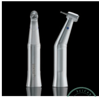
STATIS ® 1.1