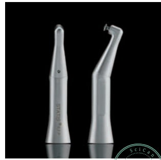
STATIS ® 6.1 P