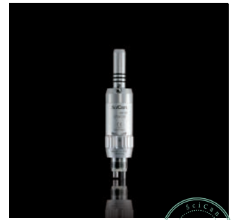
STATIS ® AM20