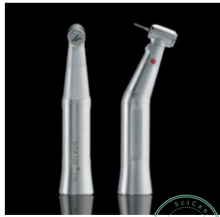
STATIS ® 1.5 L