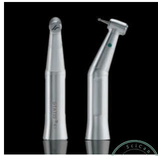
STATIS ® 4.1