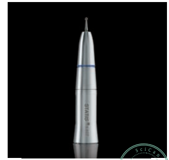
STATIS ® 1.1 ST

Designed with the 1:1 transmission ratio. Maximum rotational speed of 40 000 revolutions/min-1. RA bur Ø 2.35 mm (ISO norm), with non-return valve to minimize risk of waterline contamination. Dual glass-rod with 25.000 LUX. Mat.-No. S20001