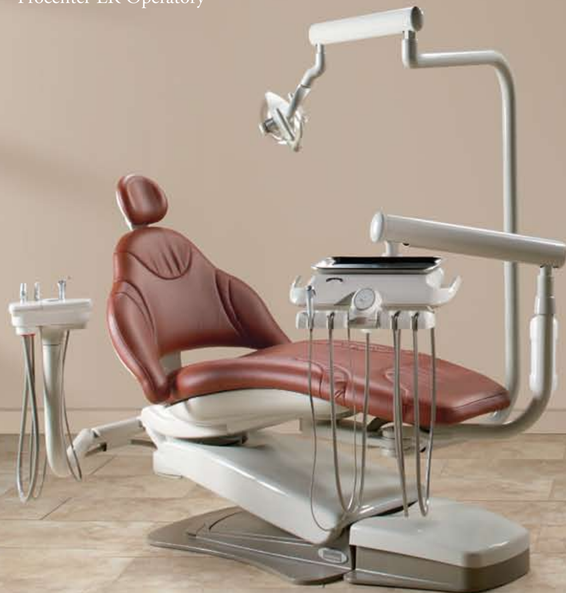
Elevance™ Procenter LR Operator