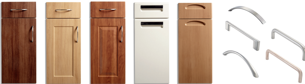
Panels: Serenity, Transcend, Pinnacle, Renew, Cove | Handles: Arc, Edge, Flare, Bent & Anti-Microbial Bent