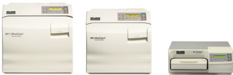
M11, M9 and M3 Sterilizers

Midmark's family of autoclaves is designed to be an all-inclusive instrument processing solution, providing you with speed, capacity, reliability and ease of use when you need it most.