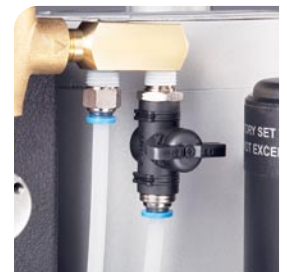
“Quick Connect” hose connections allow for tool-free serviceability. Water Recycler By-Pass Valve provides extra protection against water mineral deposits.