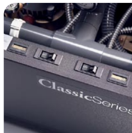
Separate Twin Model On/Off switches and Hour Meters provide operational versatility.