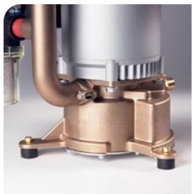
Redesigned intake manifold allows for smooth air flow and greater efficiency.