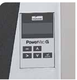
The PowerVac® G control panel allows you to easily select the vacuum level that meets your needs.