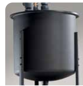
The PowerVac® G has a super capacity separator large enough to meet the needs of any office.