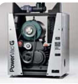
The powerful 3HP motor can meet the vacuum demands of up to 10 users simultaneously.