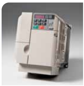
Only the PowerVac® G has the intelligence to produce just as much vacuum as you demand and nothing more.