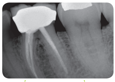
Preva 0.4mm focal spot